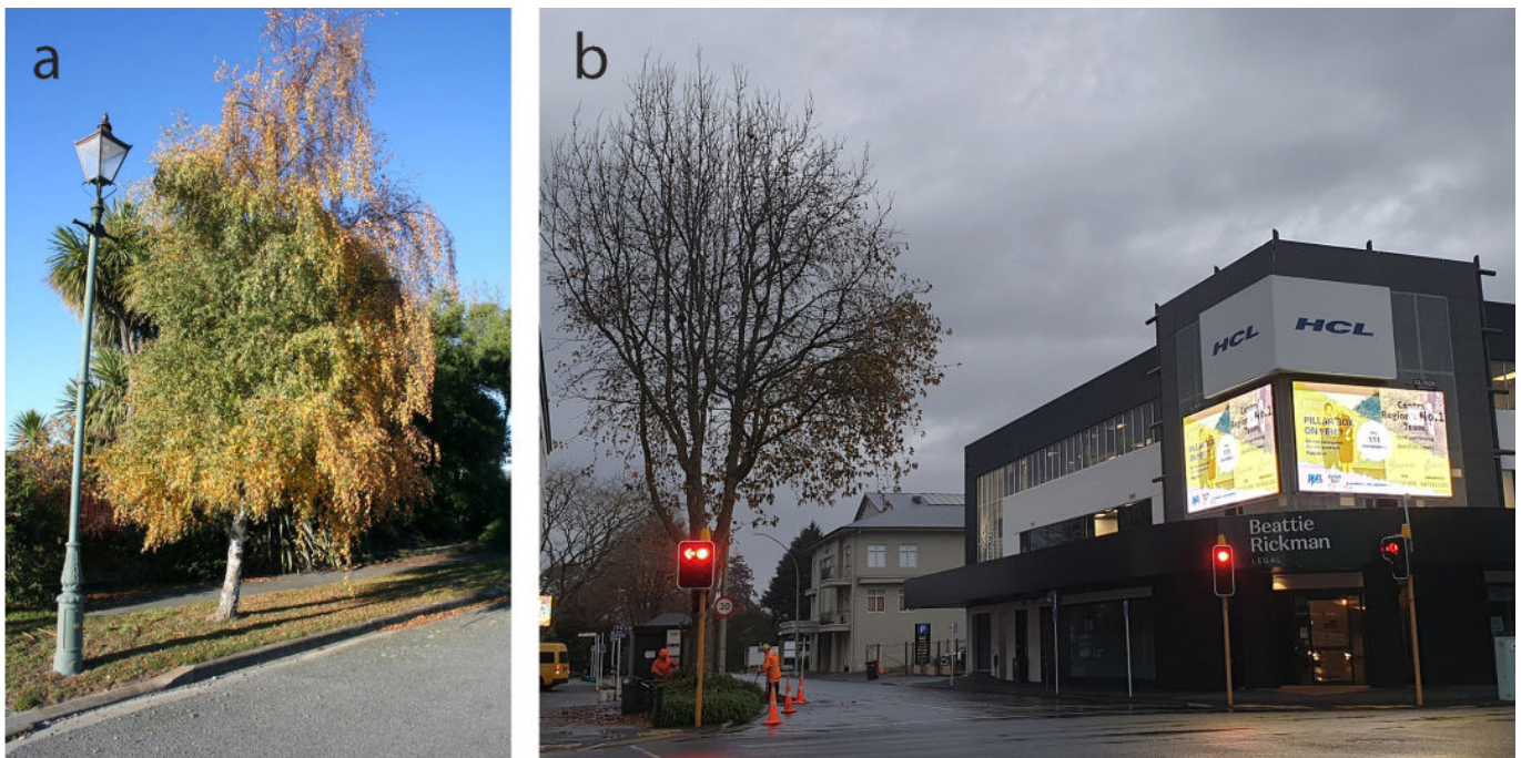
Figure 4. Light emitted at night can delay the onset of leaf senescence. (a) a birch ( Betula sp.) shows senescence only of leaves not directly adjacent to a streetlight in Darfield, Canterbury, and (b) light emitted from digital billboards within the Hamilton city centre delays senescence on the light-exposed side of a liquid amber tree ( Liquidambar styraciflua ).

2014; McNaughton et al. 2021). Species also responded differently depending on the colour temperature of white light. For example, Pawson and Bader (2014) did not detect a significant difference between the abundance of terrestrial invertebrates that were attracted to lights ranging between 2700 and 6500 K CCT, whereas forthcoming research found a difference in attraction between 2700 K and 6000 K for some aquatic invertebrate taxa (M. Greenwood, NIWA, pers. comm.; Schofield 2021).