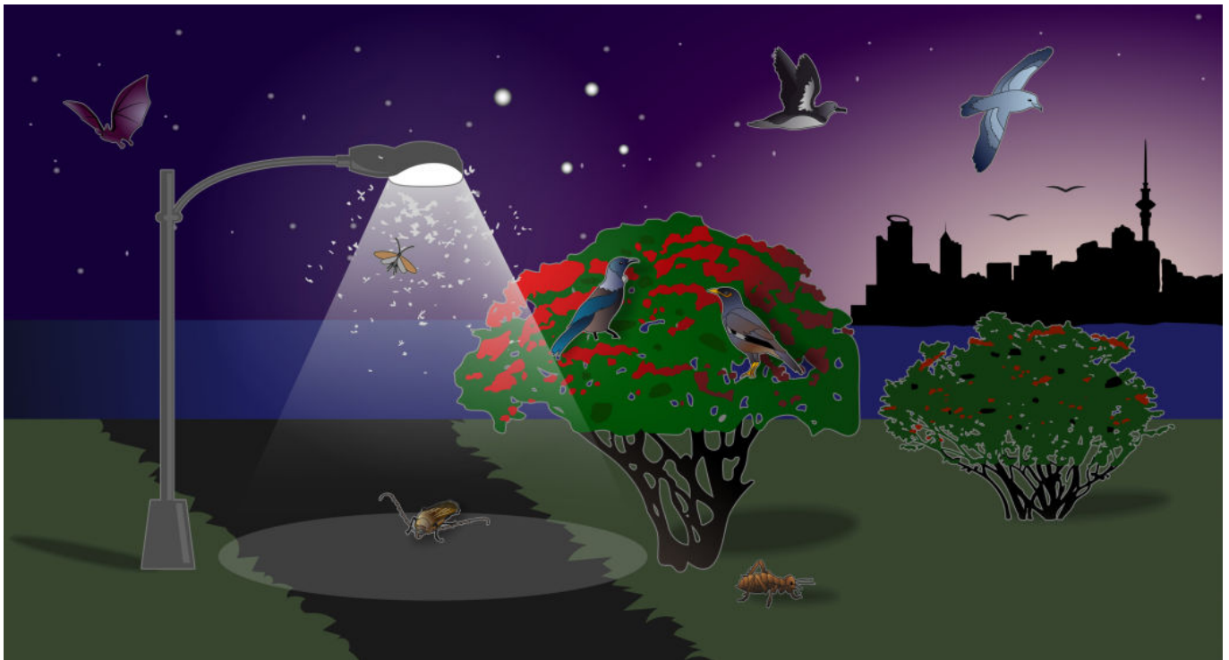
Figure 3. Artificial light at night (ALAN) from local sources (e.g. streetlights) or diffuse sources in the distance (skyglow) can impact the physiology, behaviour, phenology, and fitness of various taxonomic groups. Positively phototactic taxa are attracted to ALAN (including caddisflies, Trichoptera, and huhu beetles Prionoplus reticularis ), while negatively phototactic taxa avoid ALAN (such as cave wētā, Raphidophoridae, male Auckland tree wētā Hemideina thoracica , and long-tailed bats Chalinolobus tuberculatus ). ALAN can also obscure natural nocturnal light sources used in navigation and disorientate seabirds and cause fall-out (e.g. fairy prions Pachyptila turtur , and Hutton’s shearwaters Puffinus huttoni ). ALAN can alter circadian or seasonal patterns. For example, Metrosideros excelsa , pōhutukawa trees near streetlights have been observed to flower more profusely than those further away from lights. Characteristics of the light perceived by taxa (e.g. intensity and colour composition) may affect the circadian responses. For example, changing high-pressure sodium streetlighting to LED fixtures coincided with indigenous tūī ( Prothemadera novaeseelandiae ) and exotic common myna ( Acridotheres tristis ) starting their dawn chorus later in the morning. The extent to which these changes affect species interactions (e.g. between predators and prey, plants and their pollinators, parasites and their hosts) has not yet been studied in Aotearoa New Zealand. Textures modified from Creative Commons Attribution 2.0 Generic licensed images.

number of publications that directly studied the impacts of nocturnal lighting, emphasising that ALAN is an understudied pollutant in Aotearoa New Zealand. Based on global studies, we expect that there is potential for other ecological impacts of ALAN on native flora and fauna beyond those presented here.